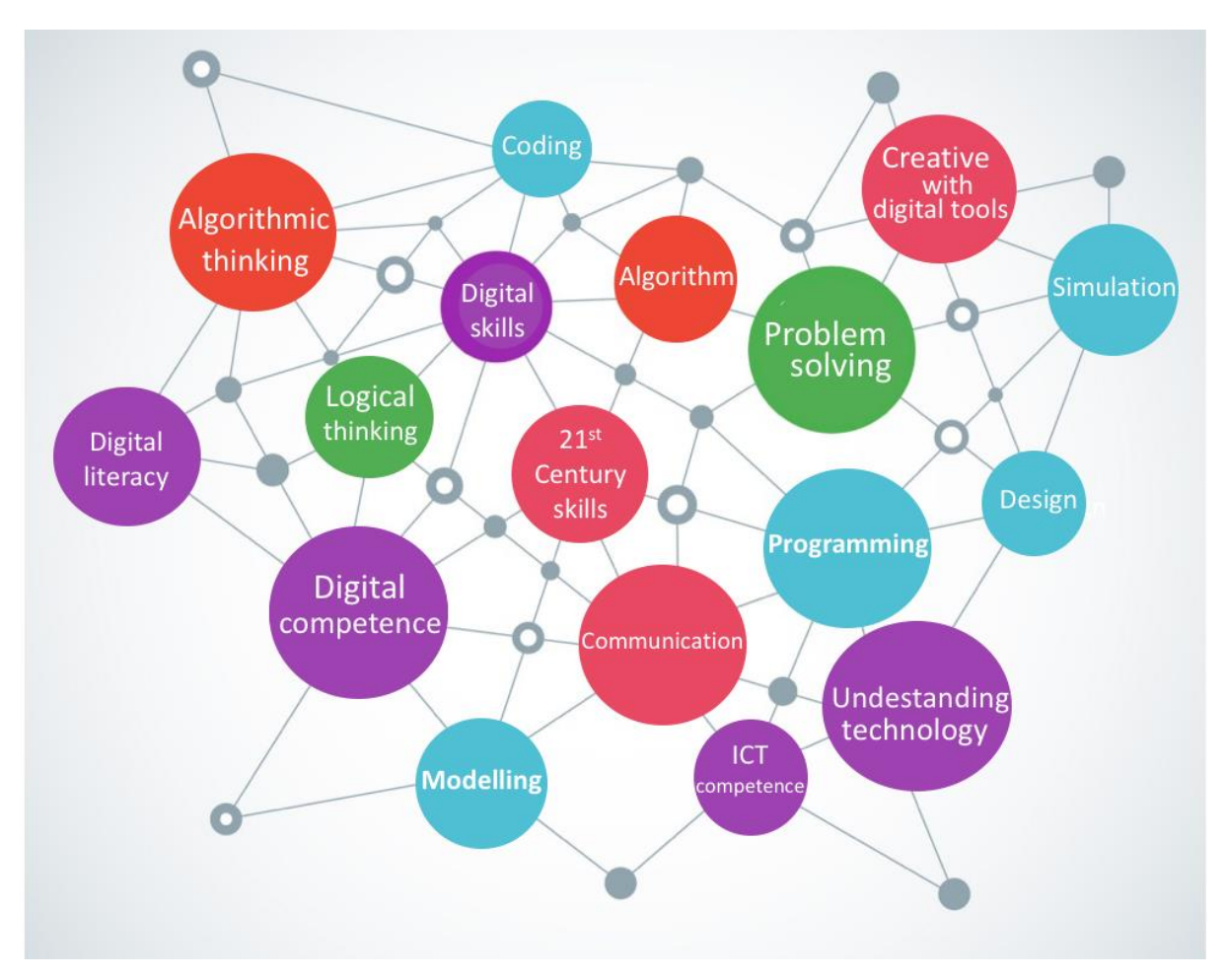
FIGURE 1. CT-RELATED TERMS USED IN NORDIC COUNTRIES' EDUCATION POLICY DOCUMENTS.

In Norway, algoritmisk tankegan (EN: algorithmic thinking ) emerges as the most widely used umbrella term that includes common CT features.