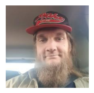
Gustaf Johansson Answered September 30

What is the starting point to learn machine learning for a non-technical person?